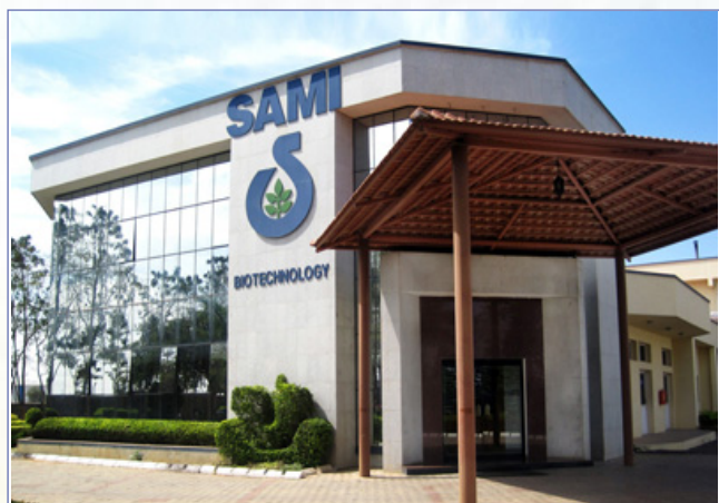
Figure 1 – SAMI (Sabinsa) FDA-inspected facility for production of LactoSpore® (Bangalore, India).

loss of viable count. B. coagulans does not require refrigeration conditions and is room-temperature stable. Each batch of LactoSpore® produced in Sabinsa's FDA-inspected biotechnology facility is inspected for sporulation and purity (Figure 1). The LactoSpore® powder produced in this facility is standardized to 15 billion spores per gram. Lower spore counts – e.g., 6 billion spores per gram – are also produced.